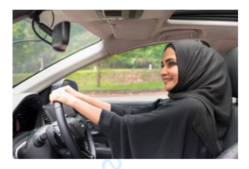
Figure 6. A photo from Shutterstock under 'arab-women-driving-car'

The following image (Figure 6) is a Shutterstock photo labelled with the metadata 'arab-woman-driving-car'. The Google image search for 'Saudi women driving' detected that this image had been used in at least three different contexts.