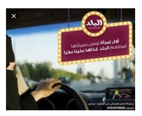
Figure 14. Free lunch

The same stock image was also used to advertise an auto repair company, which offered free services for the first 100 women who crashed their car. Here again, advertising elements are strategically superimposed on the image so that they interact with elements in the picture. The blue rectangle in which the offer is communicated, for instance, almost totally covers the windscreen, obscuring the diver's view (making a car crash more likely!). More importantly, the offer itself and the condescending way it is expressed reinforces stereotypes about women being poor drivers. Notably, the offer applies to the first 100 'girls' (بنت), as opposed to the word 'woman' (امراة) which was used in the previous advertisement, who have crashed their cars, the agency for the 'crashing' (نصنم) being attributed to the 'girls' (rather than saying something like 'girls who have been involved in an accident').