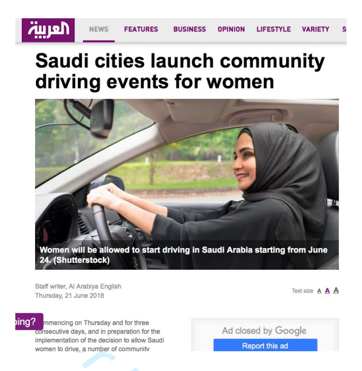
Figure 7. A Shutterstock image used in Al Arabiya news

Interestingly, this is not the first time this photo had been used by this news outlet. On the previous day, June 20, 2018, it accompanied an article with the headline 'How Saudi Women driving has changed gender discourse in the West' and the caption 'Many Saudi women don't want to lose the guardianship rule because they feel safety being cared for' (Figure 8). Here, the image is recontextualized within events on a wider 'scale': rather than the local scale of municipal celebrations, it is meant to be interpreted on the scale of international relations and intercultural difference, On this scale the smile the woman's face takes on a very different meaning, becoming a challenge to Western discourses that portray Saudi women as oppressed. The caption re-orients the way viewers might interpret the smile, suggesting that it might partly be due to the fact that the figure can now drive, but to her feeling of 'being cared for' in the context of the guardianship system (under which Saudi women need the permission of a male guardian to leave their homes).