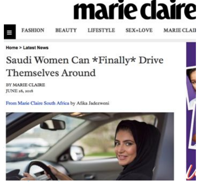
Figure 11. Saudi Women Can *Finally* Drive