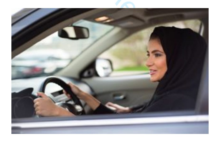
Figure 9. Shutterstock image 'Arab-woman-driving-car'

Another example of an image that shows up in different contexts is the Shutterstock image below (Figure 9). In the Google images search, this image was found on the website for the Montenegrin version of the international fashion magazine Cosmopolitan (Figure 10).