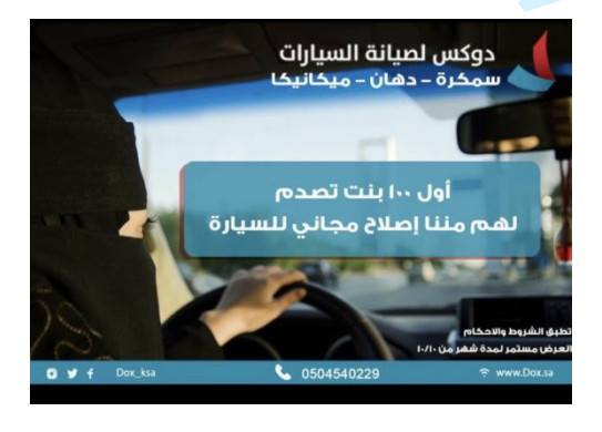
Figure 15. Free service for first 100 girls crashing

The same stock image was also used to advertise an auto repair company, which offered free services for the first 100 women who crashed their car. Here again, advertising elements are strategically superimposed on the image so that they interact with elements in the picture. The blue rectangle in which the offer is communicated, for instance, almost totally covers the windscreen, obscuring the diver's view (making a car crash more likely!). More importantly, the offer itself and the condescending way it is expressed reinforces stereotypes about women being poor drivers. Notably, the offer applies to the first 100 'girls' (بنت), as opposed to the word 'woman' (امراة) which was used in the previous advertisement, who have crashed their cars, the agency for the 'crashing' (نصنم) being attributed to the 'girls' (rather than saying something like 'girls who have been involved in an accident').