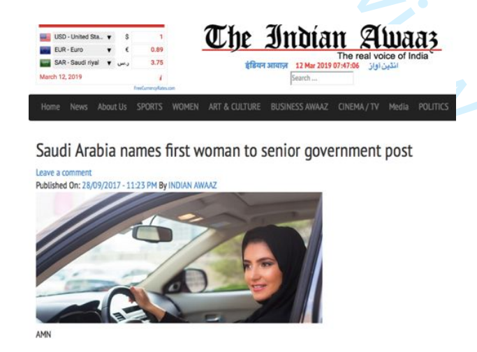
Figure 13. Saudi Arabia names first woman to senior government post

Finally, the image also appears in an article from the Indian website The Indian Awaaz (Figure 13). This article, however, although it mentions the lifting of the ban on women driving, is not centrally about this topic, sporting the headline 'Saudi Arabia names first woman to senior government post'. One effect of the use of this picture is to suggest a relationship between this high-level appointment and the decree to end the ban on women drivers, though there no clear connection between these two events. Another possible effect is to suggest that the model pictured in the photo is actually the newly appointed assistant mayor of Al Khubar governorate, Eman Al-Ghamidi. She is not. Really what you have here is a kind of iconization of Saudi women diving to communicate the generic idea of the advancement of women's rights in Saudi Arabia and the Middle East more broadly.