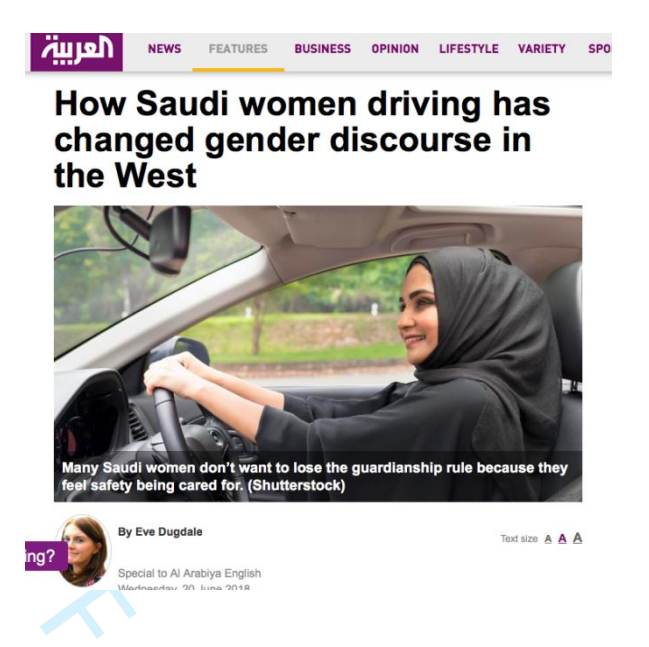
Figure 8. Different context, same photo

Another example of an image that shows up in different contexts is the Shutterstock image below (Figure 9). In the Google images search, this image was found on the website for the Montenegrin version of the international fashion magazine Cosmopolitan (Figure 10).