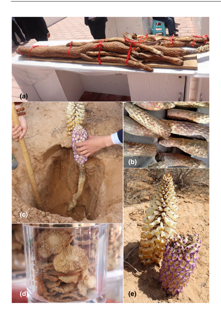
FIGURE 1 (a) Cistanche 'Rou Cong Rong' used for herbal medicine at a festival in Alxa League, China. (b) Fresh stems of Cistanche 'Tamarisk' (identified locally as C. tubulosa ), or 'Guan Hua Rou Cong Rong', sourced from plants grown commercially in Xinjiang. (c) C. deserticola harvesting, showing the long subterranean stem that is prized in herbal medicine; (d) the dried product traded as Rou Cong Rong; (e) colour morphs of putative C. deserticola in cultivation in China

& Karzhaubekova, 2015; Gu et al., 2016; Shi et al., 2009; Yan et al., 2017). Several species of Cistanche are reported in TCM, particularly C. deserticola (Figures 1e, 2b and 3d) and C. tubulosa s.l. (Schenk) Wight ex Hook.f. (Figures 2h and 3c). Cultivation of highly prized C. deserticola (Rou Cong Rong) and the more affordable alternative C. tubulosa s.l. (Guan Hua Rou Cong Rong) in particular is well-established now in China. Indeed, it has been estimated that Cistanche cultivation in China now covers an area as vast as 1.26 million mu (84,000 ha) with an annual output of 6000 tons and a value of over 20 billion China Yuan (Song et al., 2021). Despite the large-scale cultivation of C. deserticola and C. tubulosa in China, other plants, for example, C. salsa (C.A.Mey.) Beck (Figures 2a and 3a) and C. sinensis Beck (Figures 2c,d and 3b) are wild-harvested and enter trade; meanwhile, others still (possibly C. salsa) are harvested in Kazakhstan and imported into the region (Egamberdieva & Öztürk, 2018; Eisenman et al., 2012).