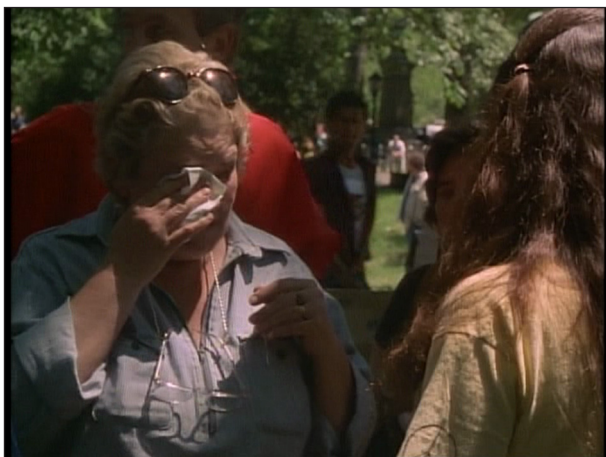
Figure 2 'I never thought this would happen where I live, in this country'.

The distinction between discourse and activity, management and use, does not hold for the entire film. In one sequence, members of a pacifist gathering are instructed to stop selling paraphernalia, much to their frustration and dismay. One particularly vocal member of the group even compares the application of park rules to the arbitrary and unbending laws of Nazi Germany, and another member breaks into tears, aghast at what she sees as a suppression of free speech. 'I never thought this would happen where I live, in this country', she cries. 'This is Russia, this isn't America' ( Figure 2 ). What are we to make of this sudden expansion of the film's scale? Is this a case of what Jonathan Kahana describes, in his writing on 'social documentary', as an 'allegorical displacement of particular details onto the plane of general significance' (2008: 26)? A different way of posing this question would be to ask what the rally members themselves had perceived the relationship between the park and the world (or their nation state) to be. There is in their demeanor and their words the sense of having been let down by the promise of a space or situation in which rules would need not apply, or in which 'common sense'