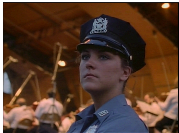
Figure 5 Present but not captivated.