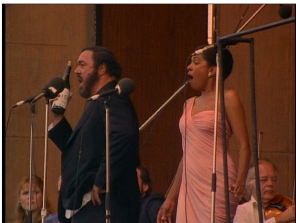
Figure 4 The opera singers.

It is through the notion of ‘address’ that Wiseman’s deployment of everydayness in Central Park can be more fully understood, particularly in those scenes which document acts of performance from a somewhat oblique perspective. In the opening pages of her recent study, Arts of Address , Monique Roelofs describes address as a ‘force of quotidian agency and receptivity’, and something that exists simultaneously through structures, modes, norms, scenes and scripts (2020: 2). Modes of address, Roelofs proposes, ‘are forms of signification that we direct at people, nonhuman creatures, things, and places, and that these entities direct at us and each other’, with considerable capacity for both inclusion and exclusion (26). Particularly clear examples of ‘address in action’ can be found in those events (speeches, briefings, performances, tutorials, etc.) in which pre-nominated individuals take up a position of centrality, authority and agency before an