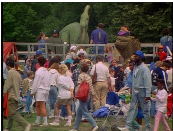
Figure 6 Dinosaur day.

In one of the film's more amusing passages, Wiseman documents 'dinosaur day' at the park ( Figure 6 ). Henry Stern, the Parks Commissioner who was previously seen in the Conservancy's board meeting, stands on a small stage wearing shorts and a sports jersey, talking about the enduring appeal of dinosaurs (with a tone and demeanor that give the distinct impression he's extemporizing). Behind a small barrier, a makeshift audience has formed, but with what prior knowledge or expectations it is very difficult to guess. The show culminates with the release of balloons, and a rather perfunctory 'that's it' from Stern. The camera picks out a series of individuals who we assume to be in the vicinity, but it is not clear whether they have been part of the small crowd, or are simply oblivious (they are not especially amused). A photographer points and focuses his lens, but seemingly in the opposite direction to the stage. Shortly after, we hear then see that some willing volunteers have been gathered to join a game, in which they imagine or invent new dinosaurs and their accompanying roars and rasps. Standing in a line, they each take a turn being handed a microphone, introducing and 'voicing' their creation, happy to participate but a little self-conscious. Across the whole passage, there is a studied ambivalence on the question