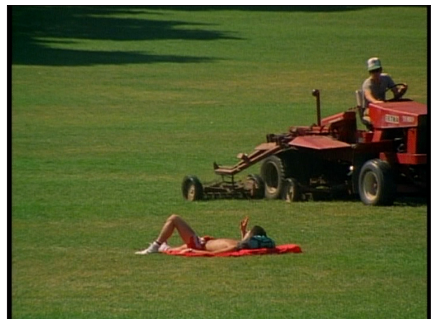
Figure 1 A small greeting.

What is the spirit of this fleeting engagement, and on what terms do these people meet? Is the horn a gesture of greeting, warning or admonishment? Is the wave one of greeting, gratitude or dismissal? The vital ambiguity emerges not just because we are insufficiently close to the people, but because we cannot confidently answer the question of who is serving whom. Most obviously the driver is serving the sunbather – one is at rest, the other is working to maintain the conditions of that rest – but, this being a municipal park, we know that the sunbather is in receipt of a resource which is not for them and them alone, and which they have neither earned nor attained in any direct sense. The economic and political coordinates by which we might normally interpret conflict