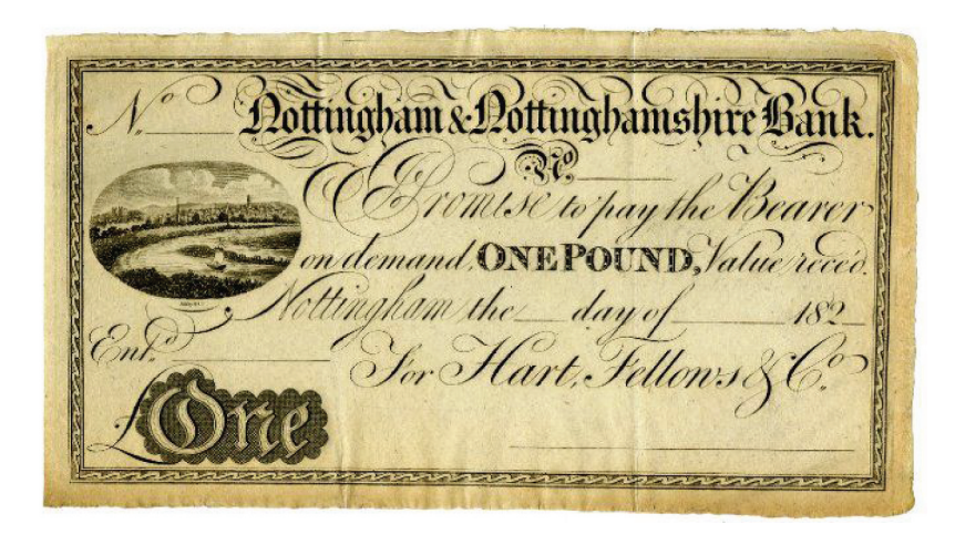
Figure 1. Nottingham and Nottinghamshire Banking Company 1 pound note, 1820–1829.

Indeed, images of local places, buildings and landmarks were common across joint stock bank notes. A Nottingham and Nottinghamshire Bank note, is shown in Figure 1. The Nottingham and Nottinghamshire Banking company was founded in 1833 and had established five branches by 1836.<sup>10</sup> It survived as a successfully independent institution into the twentieth century, when it was taken over by the London, County, Westminster and Parr's Bank Ltd. (Orbell and Turton 2001, 421). The image on the bank note contained a view of the River Trent, clearly identifiable by those who knew the town. Nottingham was a center for hosiery and lace manufacture and the River Trent, as well as linking canals, permitted the transportation of manufactured goods to internal and external markets. Hosiery was taken for export via water to the northern eastern port of Hull. These waterways were also vital in the transportation of coal from the North Nottinghamshire and Derbyshire coalfields. The River Trent was thus a key part of the local landscape, and a signifier of trade and economic activity. A church can also be seen on the horizon. More prominently is Nottingham castle, perched on a sandstone cliff, and instantly recognizable as a prominent part of the local landscape (Church 2006).