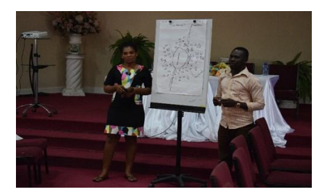
Two community members presenting the results of their mapping activities

The Transition Management approach has been inspiring community members in Dodowa (Ghana) to actively organise in different groups to solve problems related to water, sanitation and waste management in their communities. Since September 2017 the T-GroUP project has been working with communities to support them to set up Transition Experiments, including multiple activities and pilot projects.