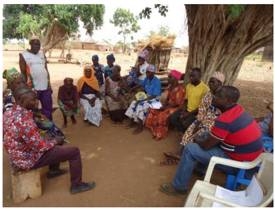
Farmer Voice Radio in action.

https://www.lyf.org.uk/2017/05/community-groundwater-resources-in-ghana-and-burkina-faso/