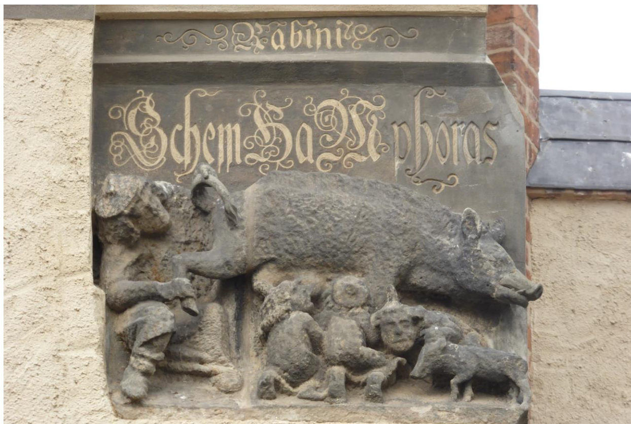
'Judensau' bas-relief, Wittenberg Stadtkirche (Germany)

A Jewish pensioner petitioned for removal of the 'Judensau' bas-relief, which depicts a rabbi peering into a pig's anus (an unclean animal), while others suckle from its teats. The court rejected the petition, on the grounds that the image was placed in 'memorial context' by an explanatory sign and was therefore not offensive to Jews. This legal case illustrates why archaeologists and heritage practitioners need to engage critically, to interrogate sacred heritage in its medieval and contemporary social contexts. Medieval sacred heritage is not neutral or inert – it carries social and political capital and ethical ramifications.