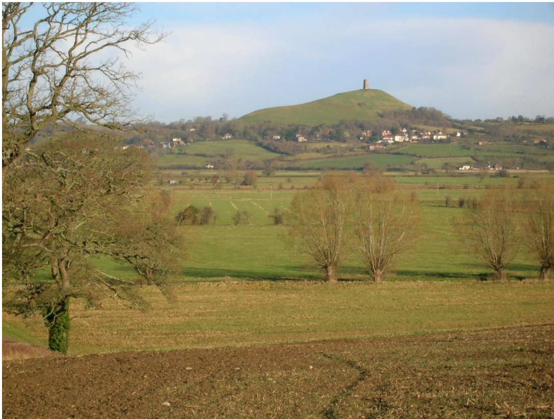
Distant View of Glastonbury Tor, Somerset, England, 2009

DM: The problematic category of ‘authenticity’ lies at the heart of your final chapter. You describe it as a kind of “sacred myth” (176). One can easily recognize the relevance of the category in the medieval era—relics, for instance, within the medieval domain of plausibility had to be the ‘real’ thing, the remains of a particular saint, in order to deliver the favors that devotees sought from the saint. The Church was alarmed by the market in fake relics and sought to regulate the distribution of relics and forbade their sale. In the modern era, the term authenticity shifts to designate another notion of ‘the real thing.’ The quest for the original, rare, or genuine is capitalized by dealers, collectors, museums, and the market in antiquities, but also by the practice of heritage preservation. How has this shift affected heritage studies and archaeology and their varying conceptions of ‘value’?