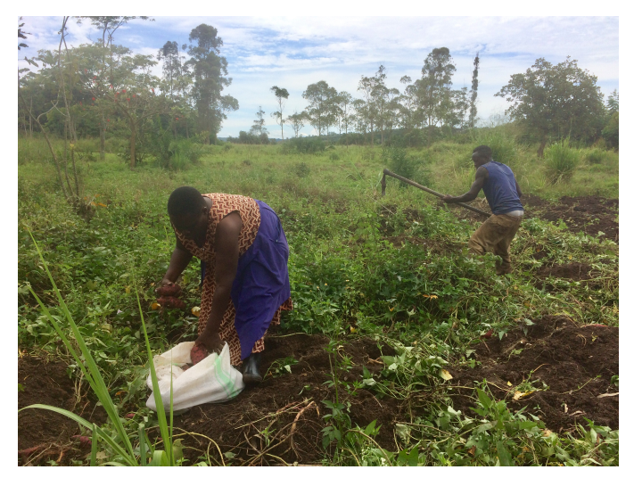
Figure 1: Sweet Potato farmers in Mukono, Uganda.