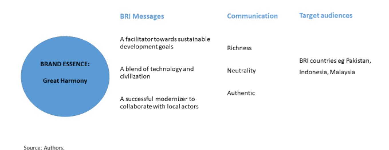
Figure 3: Nation Branding for the BRI

It could be argued that the notion of the Great Harmony might echo Japanese