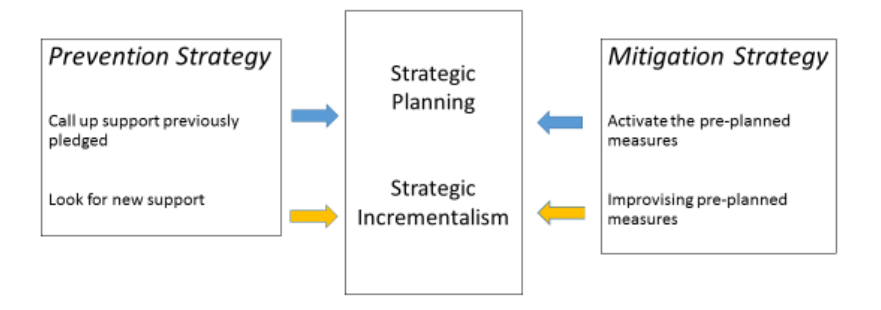
Figure 2: Strategic Approach for Managing Political Risk

differentiates the management of political risk before and after MNEs' commitment to a host country and suggests a typology of responsive actions. From a managerial perspective, the prevention and mitigation strategy available to firms in tackling political risks are further underlined by a planned yet incremental approach as summarized in Figure 2. This means that an approach that build on strategic planning, which could subsequently be adapted to changing environment could be the basis for a nation branding model.