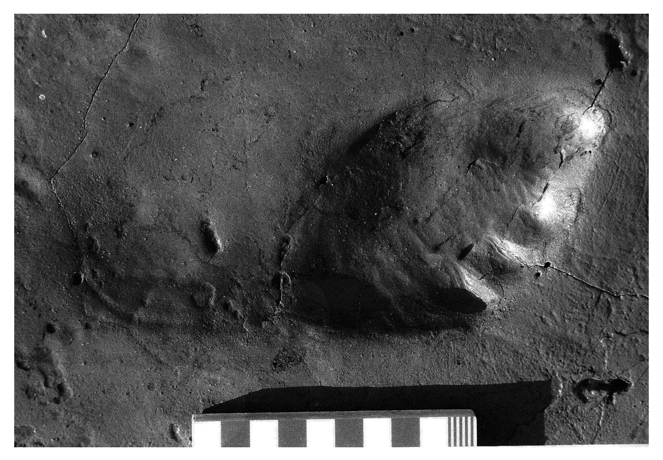
Figure 15.3: Goldcliff Mesolithic human footprint of a young person aged 8-9. (Photograph: E. Sacre.)