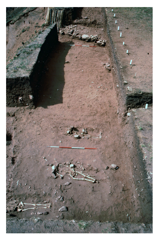
Figure 15.2: Brean Down excavation 1989: field wall on colluvial Unit 4a, the surface of which shows indistinct linear ploughmarks along the contour. In the foreground are burials of a post-Roman cemetery.

In the Brean sequence there were two distinct episodes when colluvial sedimentation from the slopes above created a distinct layer of finer and stony sediment within the sand (Macphail1990; Bell 1992). The first (Unit 6), apparently eroded soil from cultivation upslope, occurred during the time of the biconical urn settlement ( c 1600 cal BC) and truncated the soil upslope down to Pleistocene head, thus ruling out cultivation of the immediately adjacent slopes above for some eight centuries. The second buried the Late Bronze Age settlement (1000–800 cal BC). This re-established a cultivatable soil which was