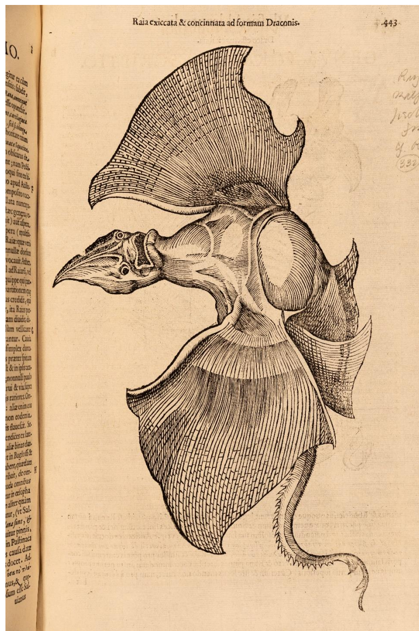
Figure 5. Aldrovandi, U. 1613. Vlyssis Aldrovandi philosophi et medici Bononiensis de piscibus libri V et de cetis lib. Vnus. Bonn: Apud Bellagambam.