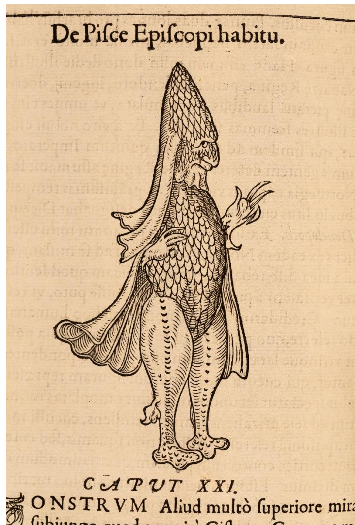
Figure 3. Rondelet, G. 1554. Libri de Piscibus Marinis. Lugduni: Apud Matthiam Bonhomme.