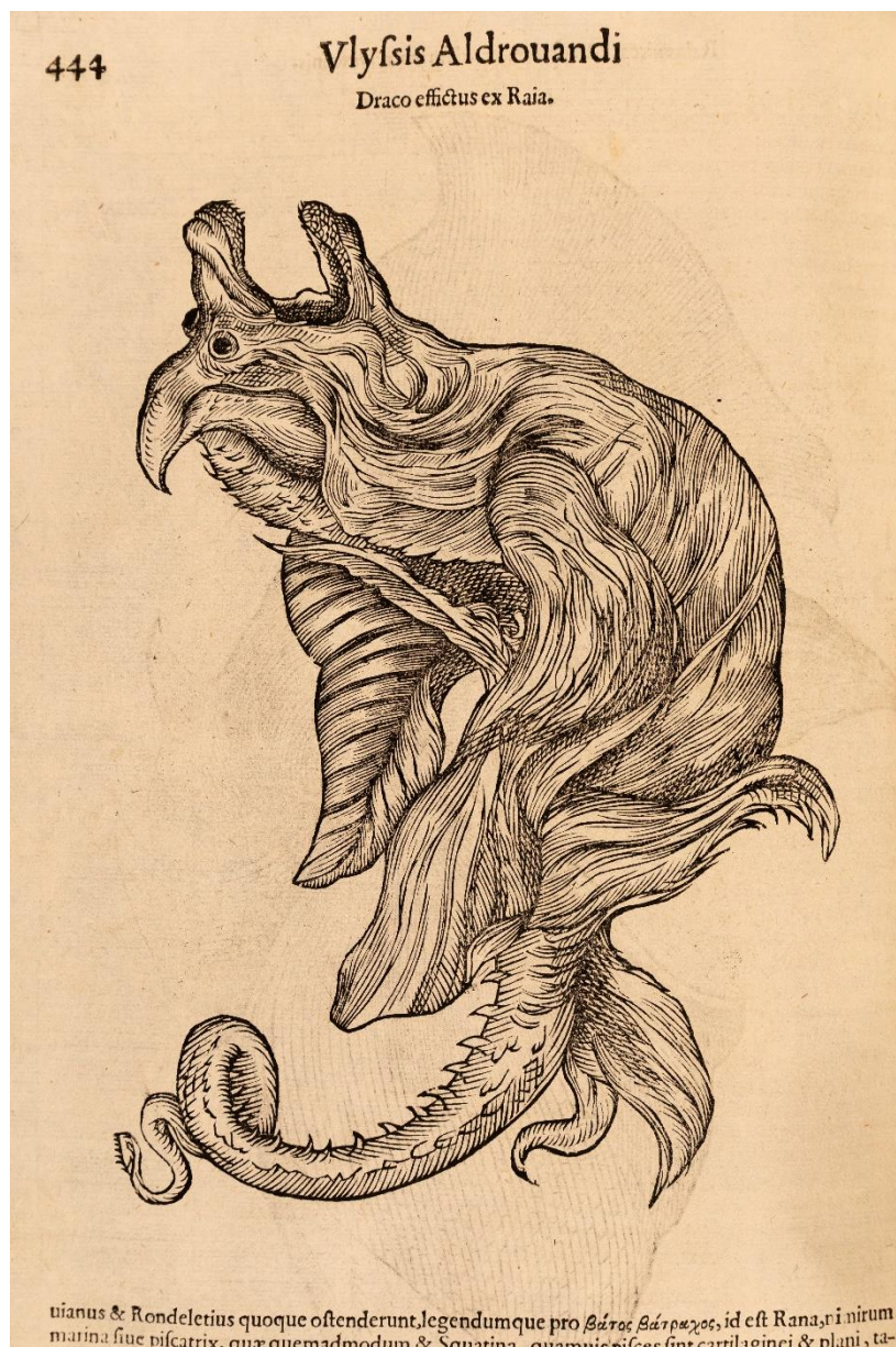
Figure 6. Aldrovandi, U. 1613. Vlyssis Aldrovandi philosophi et medici Bononiensis de piscibus libri V et de cetis lib. Vnus . Bonn: Apud Bellagambam.