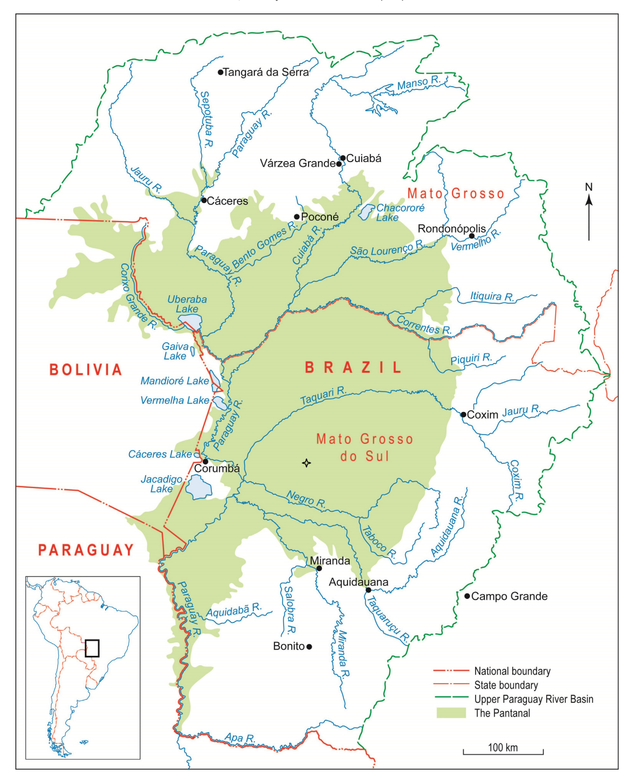
Fig. 1. Location and extent of the Pantanal wetland in South America. The star in the Nhecolândia region depicts the Nhumirim Farm (see Section 2.2 for further discussion); Outline of the Pantanal based on Assine et al. (2015).

(Calheiros et al., 2012; Coelho da Silva et al., 2019). Different authors differ with regards to their assessment in how far these impacts can be mitigated through careful reservoir management, also considering the variation in size among dams (Bergier, 2013; Fantin-Cruz et al., 2015; Zeilhofer and de Moura, 2009), and further research is thus warranted (Coelho da Silva et al., 2019; Silio-Calzada et al., 2017). Another example are the high levels of mercury in rivers polluted by gold mining activities, which then accumulate in fish and other animals of the local food