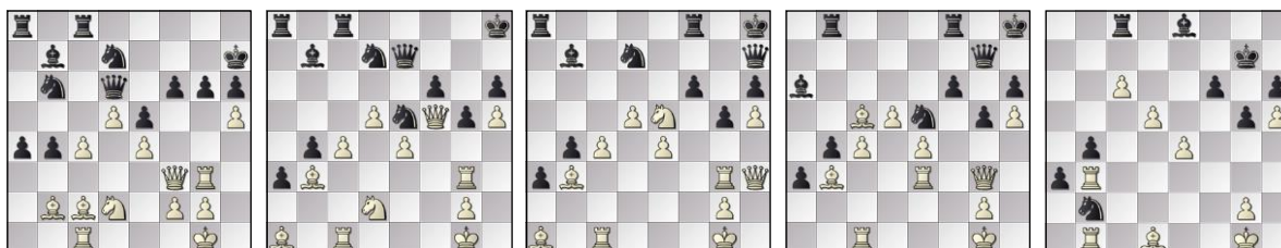
Fig. 3. LC0–HOUDINI, Game 8: positions (a) 27b, (b) 33w, (c) 35b, (d) 40w and (e) 54b.