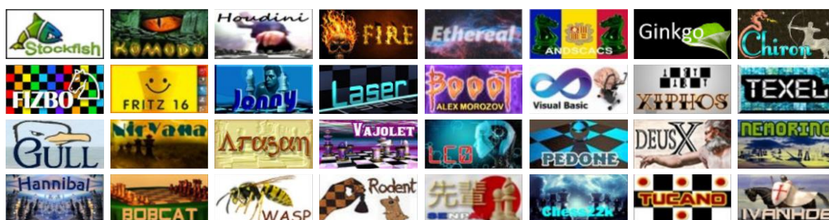
Fig. 1. Logos for the TCEC Cup engines in their seeded order (STOCKFISH → KOMODO → ... → IVANHOE).

The event was fully seeded on TCEC13 results, and Fig. 1 depicts the logos of the engines in seed order. Basic engine details have been published elsewhere (CPW, 2018; Haworth and Hernandez, 2019a) but some fifteen engines as indicated in Fig. 2 were upgraded for the Cup, a testimony to the energy and enthusiasm of their authors. The format was of 8-game matches at the Rapid tempo of 30’+10’’/m, the opening being repeated with colours reversed after every odd-numbered game. The first four ply were defined from a set of 504 openings, chosen at random by the second author here, their relative frequency reflecting that seen in human play. Decided matches were truncated and tiebreaks were resolved by further pairs of games, unusually at the same tempo and with no Armageddon backstop.