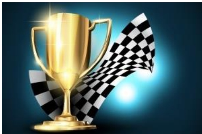
Fig. 7. The TCEC Cup, to be inscribed.