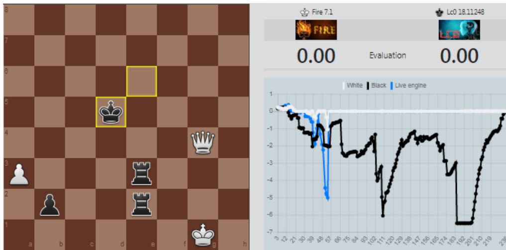
Fig. 4. FIRE–LC0, game 10. Kibitzing STOCKFISH’s evaluation, ‘draw’, agrees with FIRE’s from position 47b.

Once again, STOCKFISH sailed through undefeated, 4\frac{1}{2} - \frac{1}{2} against CHIRON. FIRE-LC0 did not disappoint the record crowd and started with a bang: LC0 scored two quick wins. Undeterred, FIRE was the first engine to close a two-point gap, following a loss in game three with a win in ‘return game’ four and a win at the last gasp in game eight. Extra time beckoned with no penalty shoot-out on the agenda. Game 10 owed its 236-move length to LC0 not recognising that its attack would be unavailing: what else was