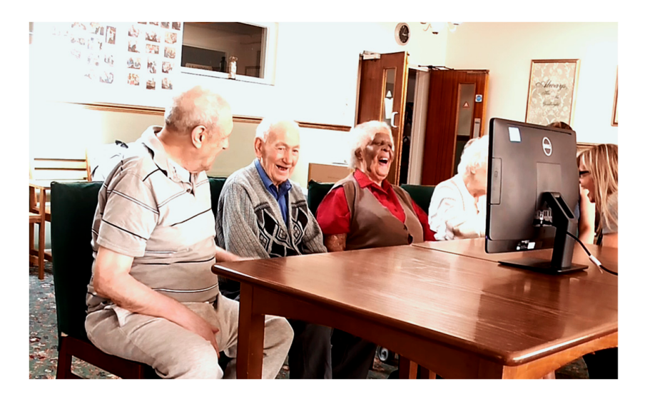
Figure 4. An example of group interactions involving CIRCA.

Following the consent procedure, each participant will complete the three formal measures (ACE-III, QoL-AD, and EQ-5D) in the week prior to the first group session. A caregiver can be present if they choose during the baseline assessment. Participants will be recruited to participate in small groups of between 4–6 individuals. Over the course of the project, between 30 and 45 groups will be required. The group intervention will run twice a week for 60 min, over 4 weeks, and consist of the group and one facilitator interacting with CIRCA. Figure 4 illustrates an example image of what a group of 5 participants plus the facilitator may look like.