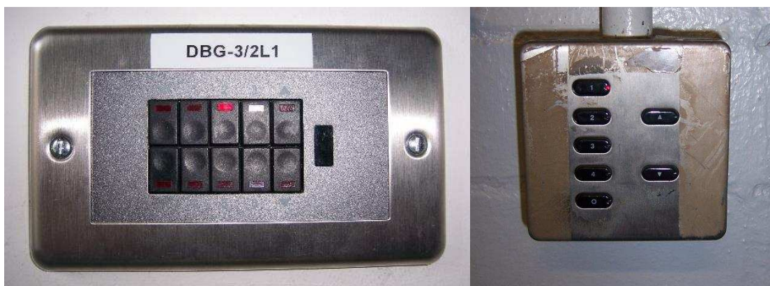
Figure 4. Two specific examples of poor classroom light switches that were explicitly mentioned in relation to participant's difficulty using the controls

and increased their sense of tension, anxiety and stress. In conjunction with poor luminaires, lighting controls can also be a means of distraction and result in a difficulty when lecturers try to use different teaching methods, examples are photographed in Figure 4