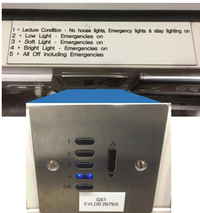
Figure 2. Chemistry lecture theatre light switch

feedback to the user about which setting is currently being operated.