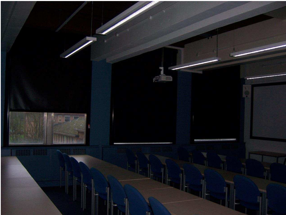
Figure 3. Classroom used for lunchtime research seminars in the School of the Built Environment

Empathy was expressed for the students and how they were affected by the classroom environment. Some lecturers suggested that this affected their learning outcomes but no measure of this was offered. Participants were directly asked about their perceived importance of a view in both their office and classroom environments. Undergraduate student learning experience and student results at the end of term have been shown to be positively influenced by access to outdoor views, although perceived stress or directed attention may be mediating the positive effects of outdoor views found in this study 21 .