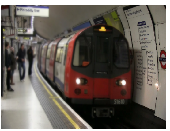
Figure 8. Myopia preset