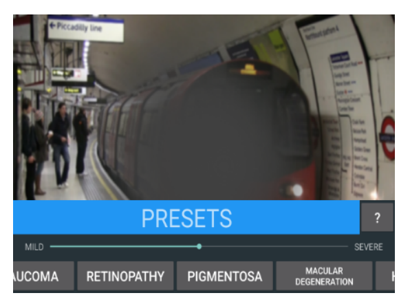
Figure 1. Presets menu.