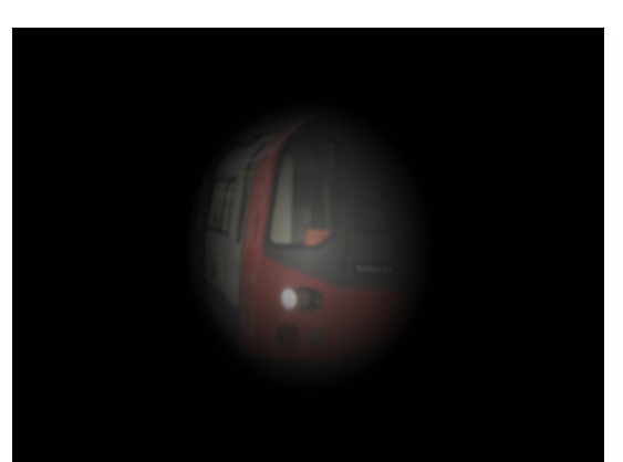
Figure 5. Pigmentosa preset.