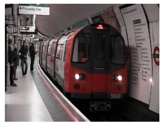
Figure 9. Colour blindness preset