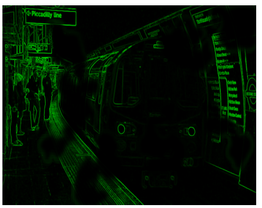
Figure 10. Edge detection tool