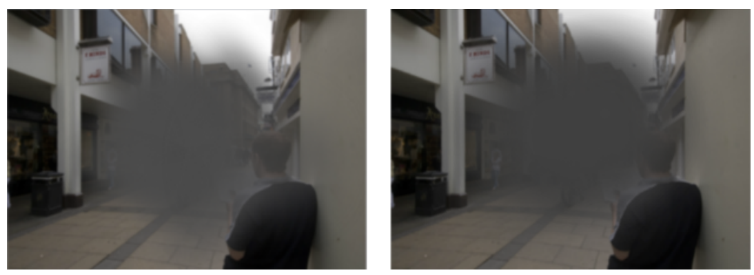
Figure 13. Macular degeneration comparison Cambridge (left) and VISAD (right)