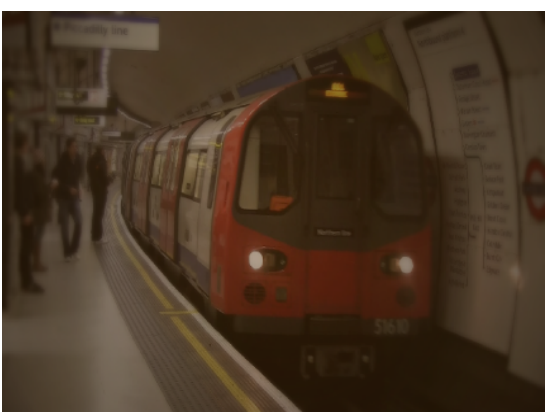
Figure 2. Cataract preset.