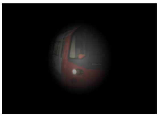
Figure 3. Glaucoma preset