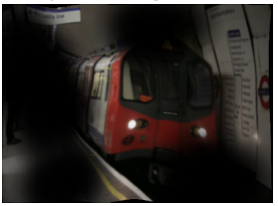
Figure 4. Retinopathy preset