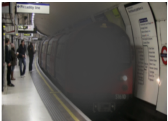
Figure 6. Macular degeneration preset.