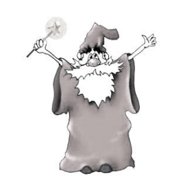
Eto krasniy volshebnik