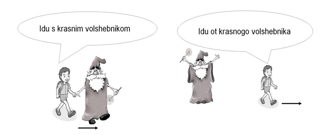
Figure 1. Example of the training slides