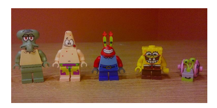
Figure 1. Introduction Slide