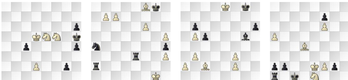
Figure 3. Four studies from Table 4: H01 (White to draw); V04, V05 and V16 (White to win).

Table 4 lists the 37 positions that van der Heijden and Vlasák chose. Authors are credited and serial numbers in the HHdBIV corpus are given. 7 The status of the positions vis-à-vis sub-8-man EGTs and FINALGEN is indicated. Some of these positions may contribute in part to a future, hypothetical test set TS3 .