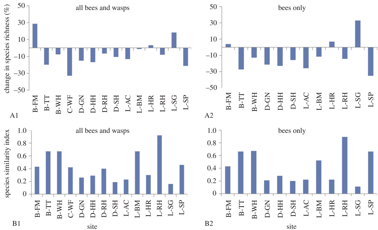
Figure 2. Percentage change in species richness (A1, A2) and change in species composition using Lennon index (B1, B2) at each site. (Online version in colour.)