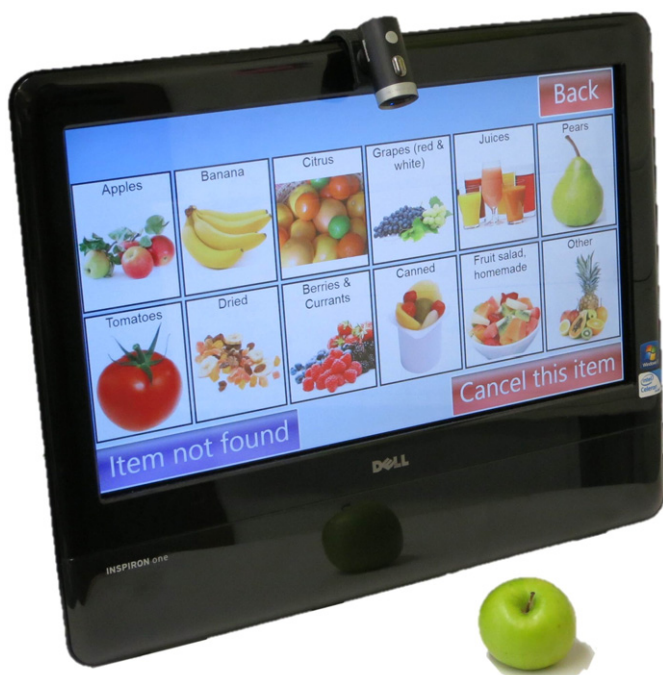
Fig. 2. NANA system showing nutrition data entry.

2.3.1.4. Other NANA assessments. The NANA toolkit also included measures of self-reported mood, appetite, exhaustion, plus a device and instructions for measuring grip strength that are not reported here (please contact the authors for further details).