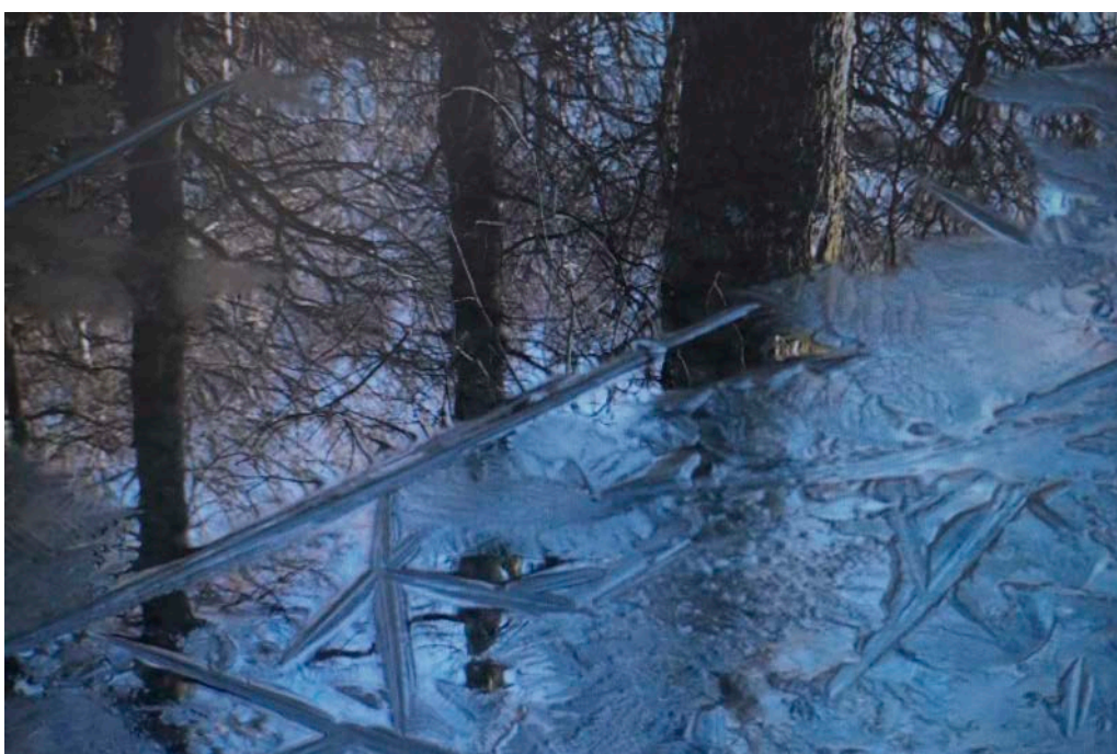
January 2011 (1) Brantwood . Still from the series of videos 'Ruskin's Ponds' - John Woodman, 2012.