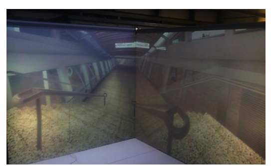
b) Navigation of concourse stairs using 3D Space Navigator Mouse

Figure 2. User inside the Whitechapel Station visualization showing both interaction (a) and navigation (b).