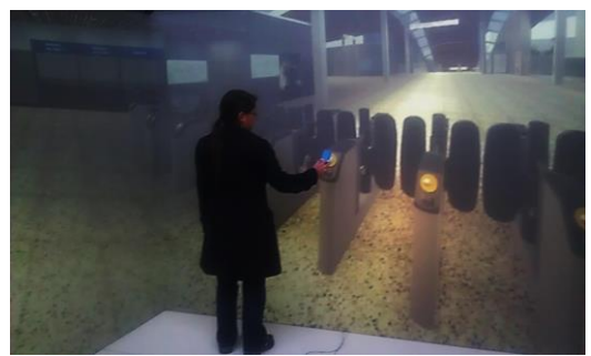
a) User testing visualization scale through simulated interaction