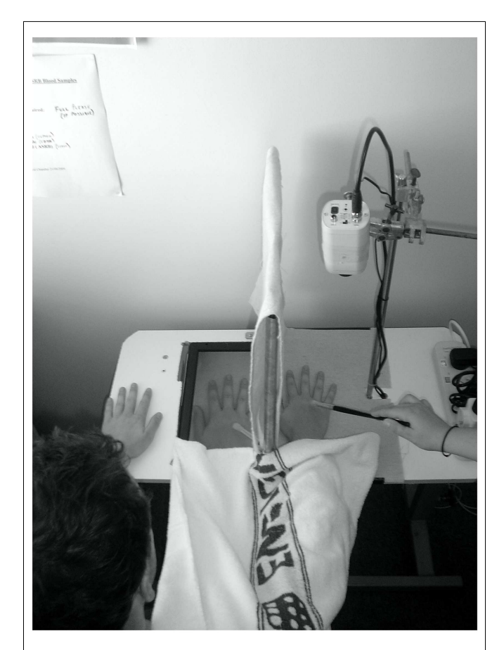
FIGURE 1 | Photograph of the projected-hand illusion is shown.

if the hand was a left or right hand by pressing an appropriate key on a keyboard. Each picture was either a left or right hand and rotated by either 0°, 90° medially, 90° laterally, or 180°. There