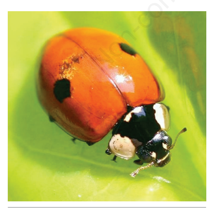
Figure 1. Adalia bipunctata L. is an important predator species supporting the natural control of aphids in many European environments.

AMIGA is performing NTO studies through bi-trophic and tri-trophic in planta tests, considering toxic effects (short-term mortality, longevi-