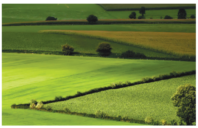
Figure 3. Agricultural landscape in Central France.