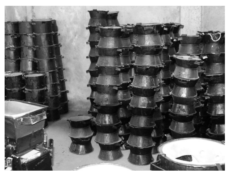
Fig. 2 Innovative energy efficient charcoal cook stoves produced by Cookswell/ Musaki Enterprises and sold to the rural BoP along with small packets of multiuse tree seeds

terms of social exclusion, capability and deprivation more specifically BoP purchases gain access to healthier and more nutritious means of cooking, through tree planting they can also develop long term household energy security, while increased income is useful in addressing other deprivations.