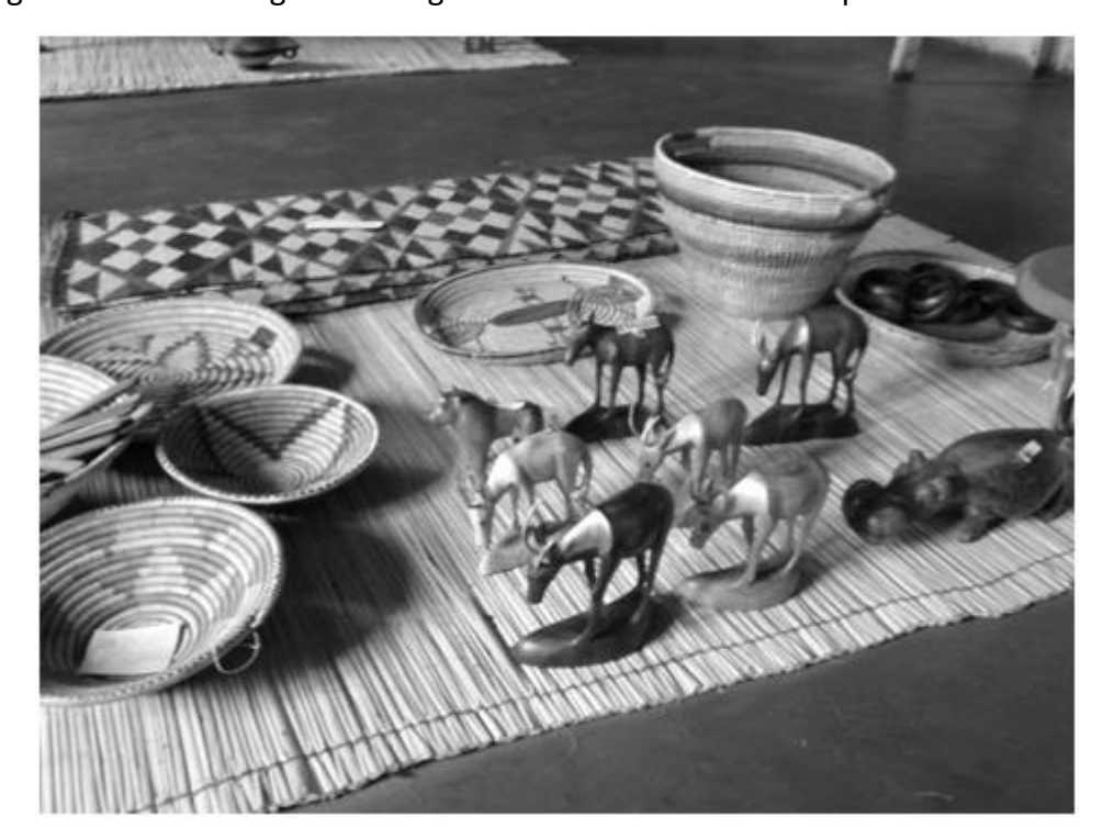
Fig. 1 Mumwa Craft Association Products

Social purpose ventures can also positively include the poor as producers of commodities, particularly agricultural. For example Eco-MICAIA and the Mozambique Honey Company purchase honey from BoP producers who have been provided with training in beekeeping, and given loans for the purchase of hives. The Mozambique Honey Company pays producers a premium price for their honey, and guarantees to purchase honey