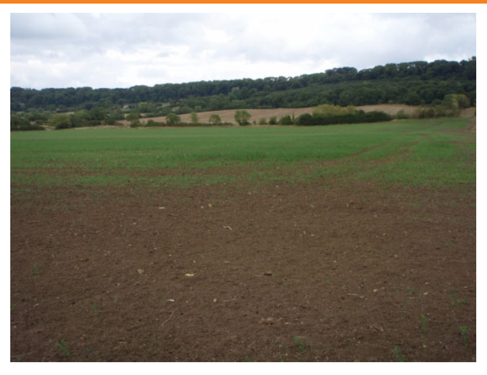
Figure 3. Cereal crop production, Warwickshire, UK. Soils are often seen as simply 'growing media' for food crops; however, functioning of microbiological communities within soils not only influences the supply of essential plant nutrients but also has great implications for the global carbon cycle and climate system that determines whether environmental conditions are favourable for crop growth.

the C cycle does not operate independently; it is closely coupled with that of other essential elements for microbial metabolism. This linkage occurs either via the use of the other elements as electron donors and acceptors (e.g. N species ranging from the most reduced, NH<sub>4</sub><sup>+</sup>, to the most oxidised, NO<sub>3</sub><sup>-</sup>) in energy transduction or via their immobilisation and mineralisation as part of multiple essential element-containing biomolecules (e.g. proteins, DNA). Hence the availability of other key elements essential for life, particularly N and P, and other environmental factors such as pH, soil texture and mineralogy, temperature and soil water content control the rate at which microbes consume and respire carbon.<sup>11</sup> It is these interactions between environmental conditions and biological processes, including primary production, that are chief in controlling the unequal distribution of organic matter across the world's soils. 12 The largest global concentration of carbon can be found in wet and cool areas in the northern hemisphere, dominated by deep accumulations of peat and permafrost soils, 13 whereas soils with the lowest carbon content tend to be those of desert biomes,14 where low mean annual precipitation limits primary production and encourages the prevalence of aerobic soil conditions.