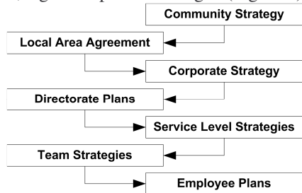
Figure 1: Pattern of strategy and plan development within local councils.

the strategies of local councils in Berkshire, England, a general pattern emerged (Figure 1).