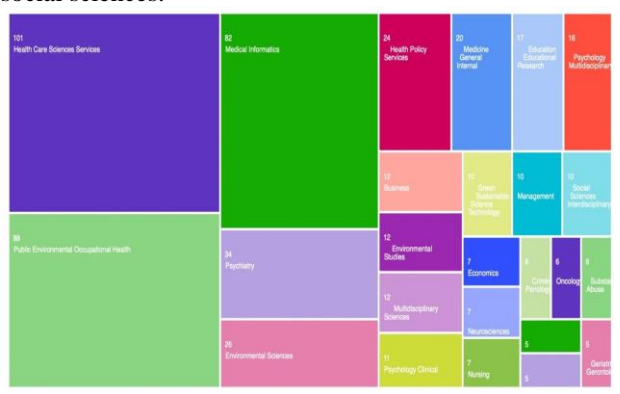
Fig. 1: Scope of disciplines covered by the literature

The scope of the 425 articles used for the qualitative analysis of the literature ranges from healthcare sciences, and medical informatics to management, business and social sciences.