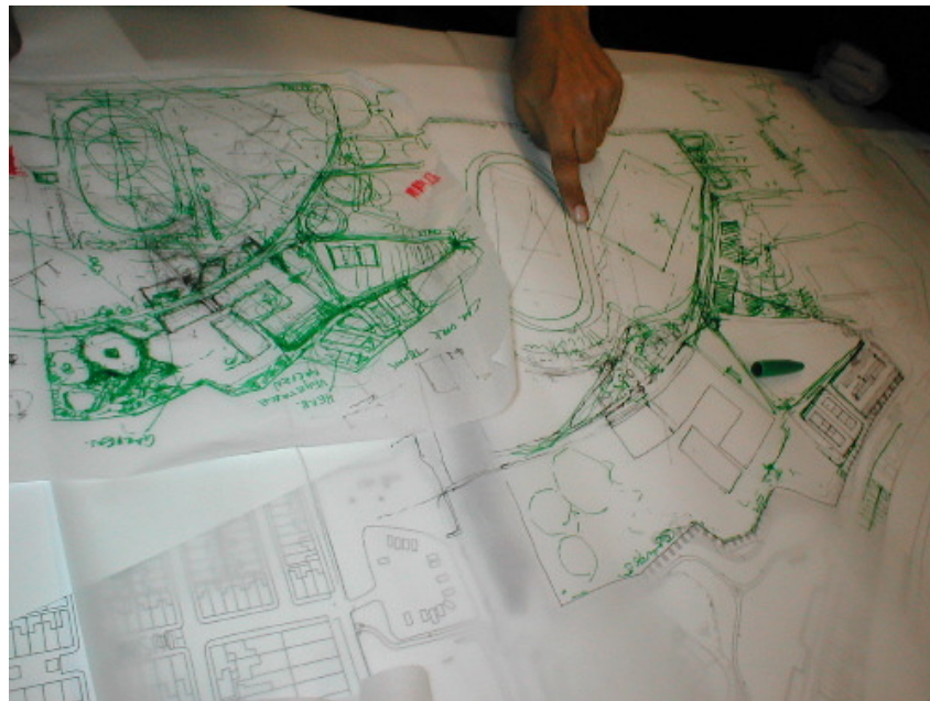
Figure 3. The original sketch, left, and a more developed version to its right.

updated version is on the right. In this drawing, the orientation of the depicted sports field has changed, apparently due to its aspect in relation to the north-south axis. This design development is largely based on practical decisions about the usefulness of the pitch as a sports facility (access, position in relation to the sun...). However, it is not just the aspect of the sports ground which has changed. In the newer drawing, the path (an arc running upwards from left in the image) has changed from a continuous curve shape to a more wavy form. In regard to the curve, Taylor explains, 'I bent the path so that it blends more'.