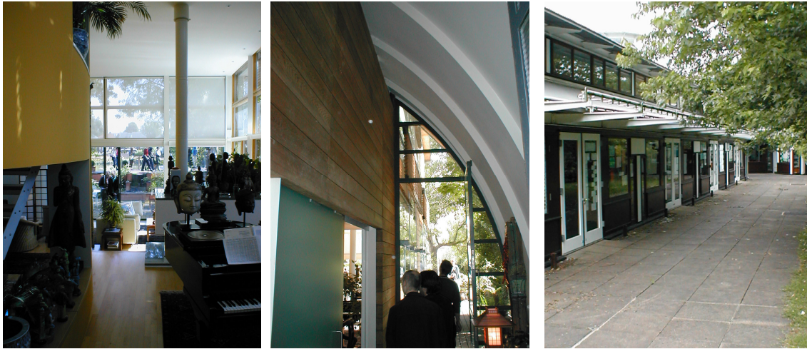
Figure 1. Snapshots of spaces designed by Edward Cullinan Architects.