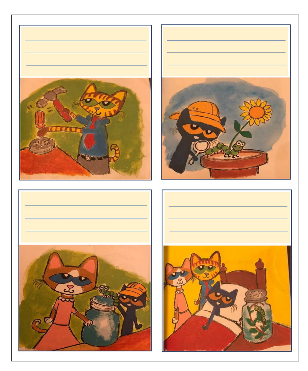
Appendix I. Example of picture cards used for the post-reading tasks.

Yang, Y., Shintani, N., Li, S., & Zhang, Y. (2017). The effectiveness of post-reading word-focused activities and their associations with working memory. System , 70, 38–49.