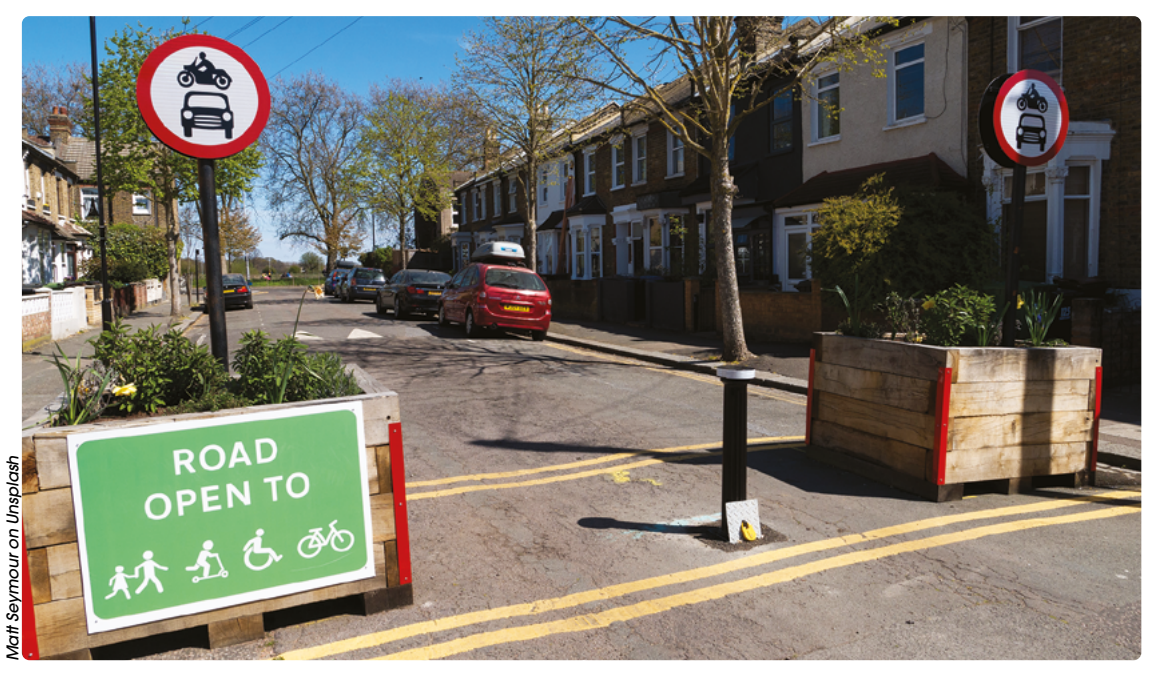
Low-traffic neighbourhoods — drawn into the 'culture wars'

practitioner can attest, such judgements also involve consideration of trade-offs over competing interests and priorities. They hold important