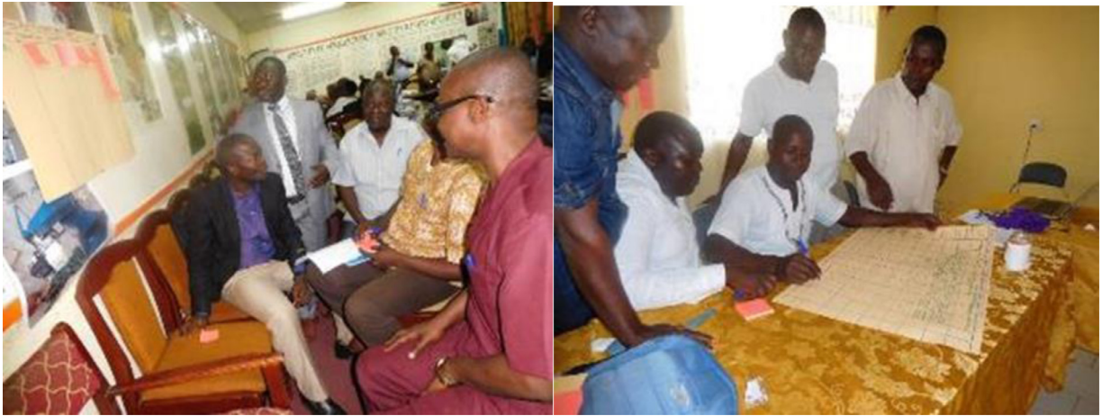
Fig. 2. A cross-section of research professionals preparing their presentations in Freetown (left) and Kambia (right).