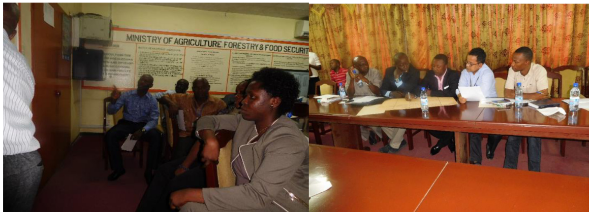
Fig. 1. MAFFS officials (left) and NGO professionals (right) preparing their presentation.

adequately record all relevant information emerging from the interviews. A social network analysis (SNA) program, UCINET, was used to organize linkages among actors as identified by research and extension actors during the workshops. Representatives from these key institutions were asked to indicate the number of ties they have with others and as well as the strength of the linkages. The freeware program contained in UCINET known as NETDRAW was used for visualizing networks into a sociogram. This helped in establishing the underlying patterns of social relations of actors in the SRI innovation (Table 4, Fig. 1, Fig. 2, Fig. 3).