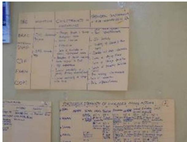
Fig. 3. Sample output of workshop discussions.