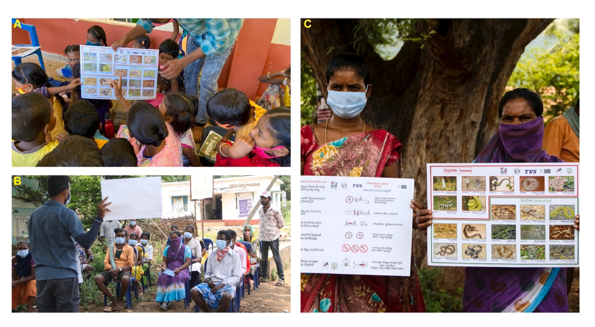
Fig. 2. Snakebite Educational Programs from the Madras Crocodile Bank Trust. The campaign team has engaged with school children (A) and villagers (B) using information posters prepared in local languages (C).

appropriate preventive and first aid measures when bitten by snakes. This approach has substantially increased their reach and impact in improving SBE awareness and changing treatment-seeking behaviour. In summary, the UoR activities have led to the engagement of a substantial number of people within Tamil Nadu, and more widely in India within a short time through effective multifaceted community education approaches.