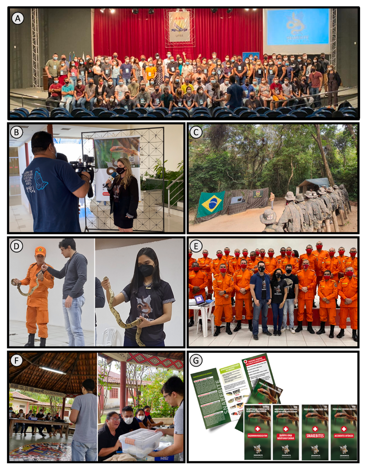
Fig. 4. Snakebite Roraima Educational Program. (A) Snakebite training exclusively for Amazon Health Professionals was performed by Snakebite Roraima and FMT-HVD (2021). (B) Prevention campaigns disseminated through mass media. (C) Snakebite management training for Roraima's army (2022). (D) A fireman and a student learning how to handle a snake. (E) Snakebite training was performed for firefighters (2022). (F) Snakebite prevention campaign performed in an indigenous community (2022). (G) Snakebite Roraima illustrated, and printed material in different languages, including indigenous.