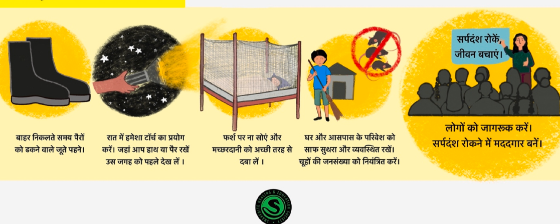
Fig. 1. Snakebite information poster in Hindi developed by the SHE-INDIA organisation.