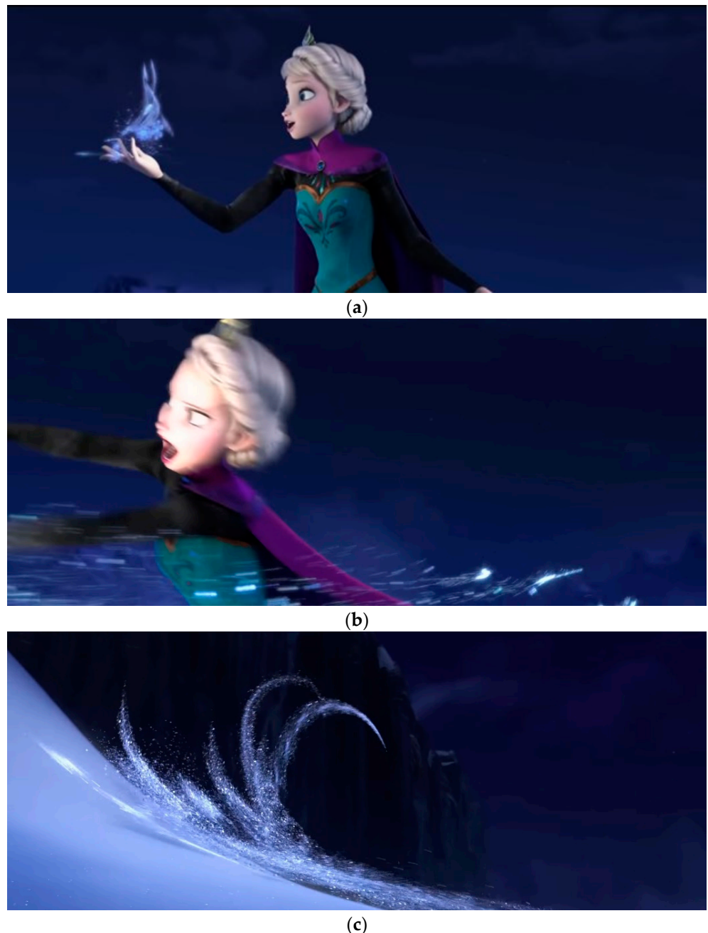
Figure 3. (a) Elsa with snow magic. (b) Elsa controlling snow magic. (c) The snow magic Elsa has made (Walt Disney Animation Studios 2013a).

Turning to the visual narration at this point, we can problematize notions of an 'out' identity through a different, yet comparable, reading (Figure 3a–c):