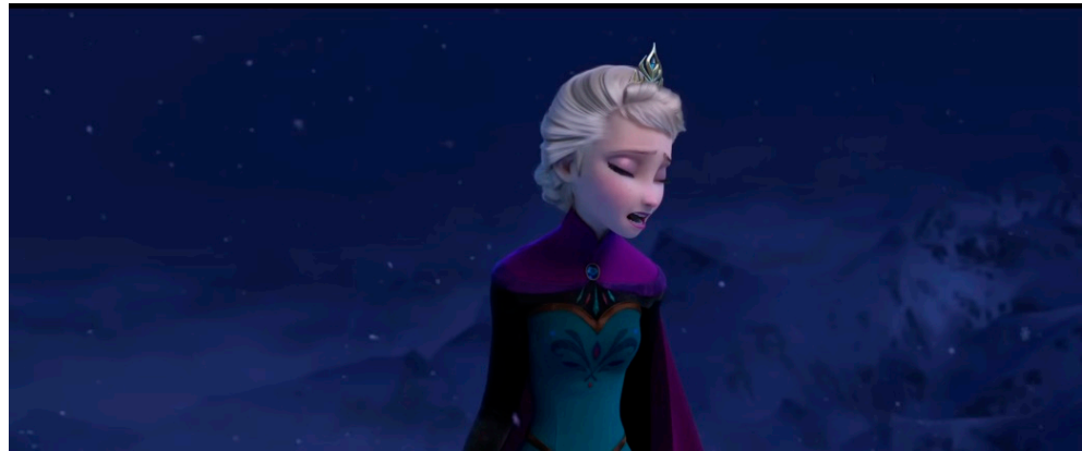
Figure 2. ‘The wind is howling like this swirling storm inside’ (Walt Disney Animation Studios 2013a).

The visual perspective on Elsa at this stage brings its own difficulties (Figure 2):