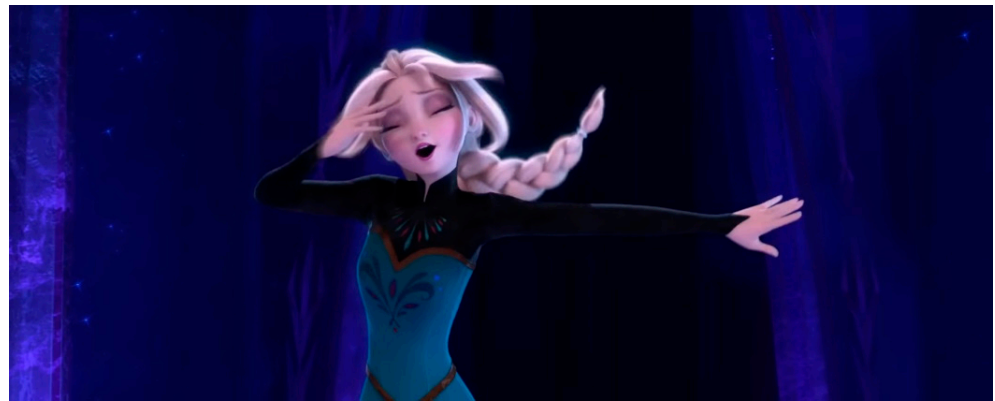
Figure 5. Elsa freeing her hair and letting go her comb (Walt Disney Animation Studios 2013a).

The dress surrounds Elsa as an addition, the hair is loosened, yet remains, and the comb is lost.