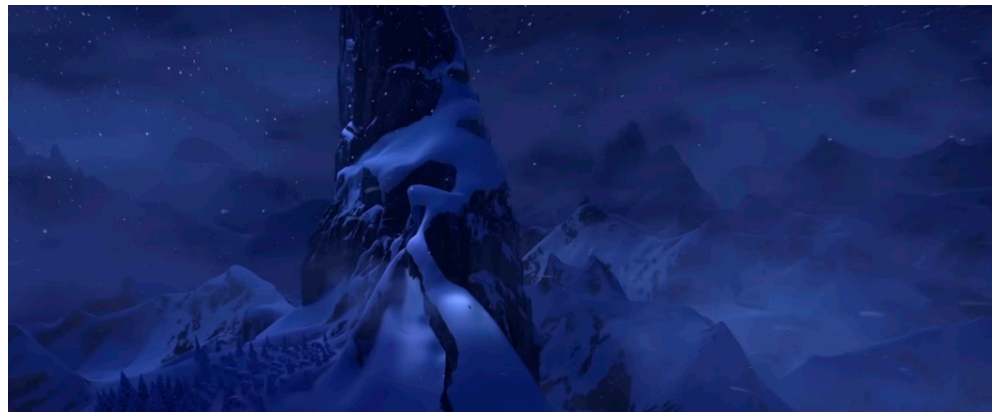
Figure 1. Elsa on the mountain (Walt Disney Animation Studios 2013a).

This, then, is not Elsa's narration . There is a framing prior to her arrival, and her isolation is confirmed by a perspective that is not her own, zooming in on her in a way that confirms the lack of others around her. The pathos of isolation requires a perspective other than that of the isolated subject.