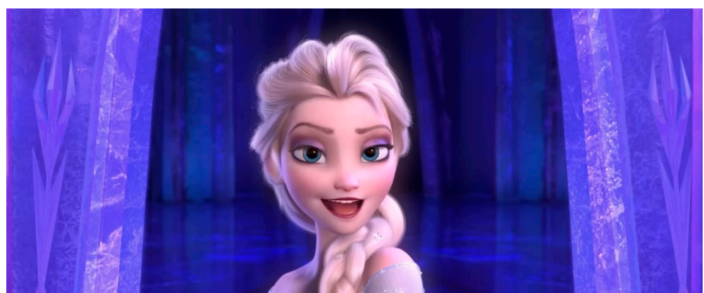
Figure 7. ‘The cold never bothered me anyway’ (Walt Disney Animation Studios 2013a).

As Elsa ascends to the balcony of her newly created Ice Palace, she sings out: ‘here I stand in the light of day’. Is this visibility? Well, if there is no darkness, we are not quite done with obscurity, as the following, penultimate line of the song sees the camera race backwards to an extreme long shot, taking in the mountains and sky around Elsa, her voice rising seemingly to fill the void. In one sense, the song moves towards its initial position, with Elsa dwarfed by the mountains, framed by the perspective as distanced. Here, however, the distance can be taken to constitute presence rather than absence or indistinctness. The next shot is a close-up on Elsa, as, in a calmer voice, she sings the final line: ‘the cold never bothered me anyway’ (Figure 7):