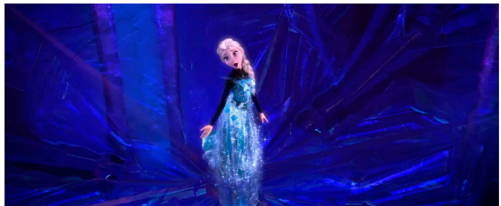
Figure 4. Elsa creating her dress (Walt Disney Animation Studios 2013a).

I read some of these tensions repeated in the scene in which Elsa constructs a castle around herself, with an initial shot of a diminutive Elsa cutting to one of the building as it rises through its changes. To come out, again, if that is what is occurring, is, at one stage, to be framed from a distance, and then replaced by something else. Additionally, in so far as the Ice Palace can be read as surrounding Elsa, it repeats another aspect of 'let[ting] it go', the creation of the princess dress (Figure 4):