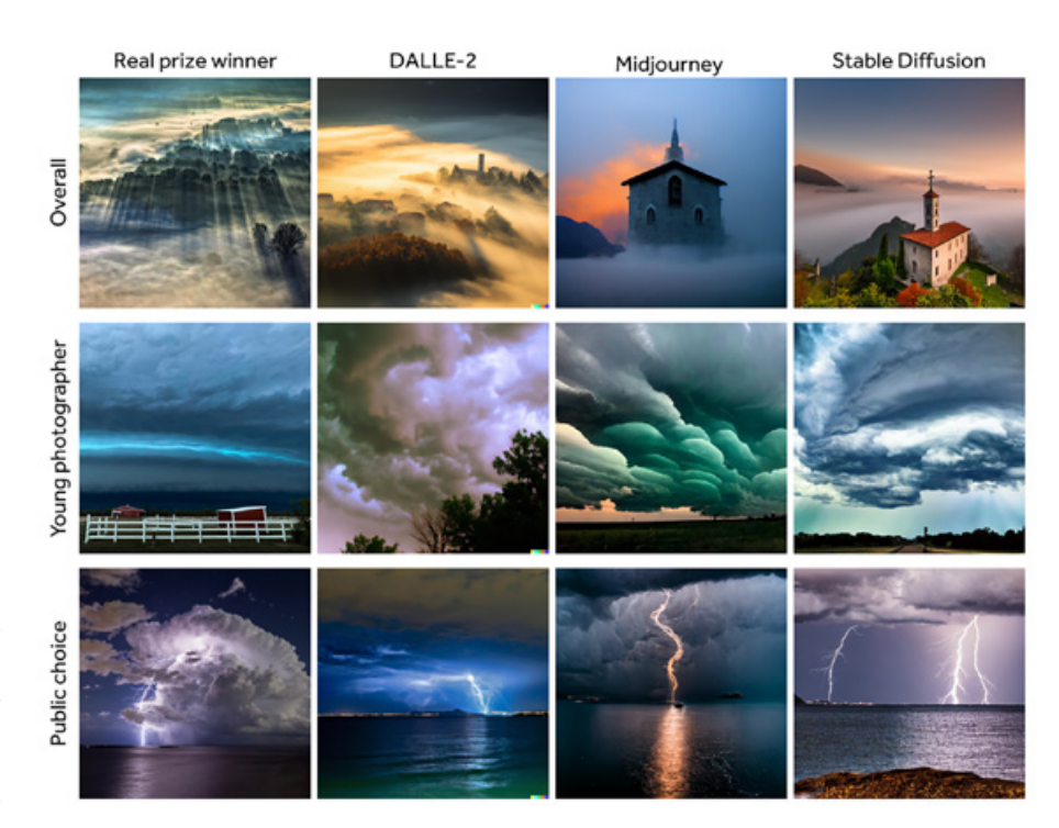
Figure 2. Comparison of 2021 winning photographs with those produced by the three artificial intelligence artists. In each case, the text used to describe the photograph and its merits on the competition website was used as a prompt, with occasional modification. Overall winner prompt: 'This photo can only be taken from one point. There is a small church on top of a hill in the town of Airuno, in the province of Lecco in Italy. Under the mist passes the River Adda. In the autumn months, on some days, it is possible to see this show with the first lights of sunrise.' Young photographer winner prompt: 'Photo of beautiful clouds coming in right before a Kansas storm. Anyone who has experienced a severe thunderstorm knows about the eerie deep green/blue colour sometimes present as the storms approach.' Public choice winner prompt: 'Lightning from an isolated storm over Cannes Bay. The judges commented that few storms are as beautiful as those isolated over water. The photographer was a perfect distance away from this storm to capture three things crucial for a winning photo composition: the sky, the storm, and the water'.

There are three final caveats before we start. First, for fair comparison throughout, all images are rendered square - either directly, or through cropping. When cropping actual photographs, I have tried to do so in as fair a manner as possible, preserving as much of the original content and artistic direction as I could. Second, I have indulged in minor 'prompt engineering' throughout. In other words, adding suggestions like 'award-winning' or the names of stock photo companies to encourage the Al artists to produce more professional-looking images. In most cases, without these additions, the AI would still produce a photorealistic depiction of the weather in the prompt, but they tended to be far less visually appealing. Third, in most cases I have had each artist produce several images for each prompt (never exceeding four) using a different random seed to generate the initial noise. This then requires one of several to be selected for use in the paper - typically I have selected those that I think best fit the competitive photography aesthetic, while