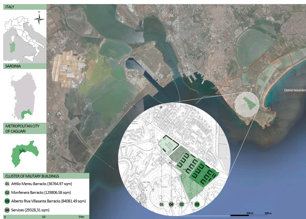
Figure 2. Cluster of military buildings in the city of Cagliari (Author: M. Ladu, 2022).

components and geographic endowments [94], mixed with historical military settlement processes.