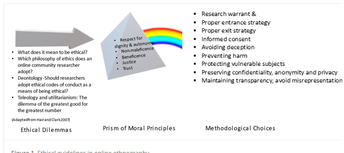
Figure 1. Ethical guidelines in online ethnography.