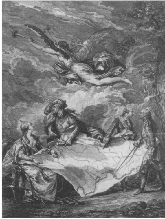
Figure 1. Untitled copy of an original engraving likely entitled “The Twelfth Cake, Le gâteau des rois” by Noël Le Mire, 1773.