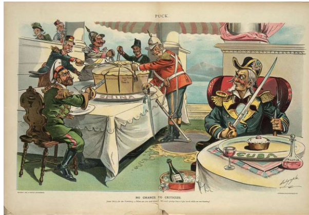
Figure 6. Louis Dalrymple, “No chance to criticize,” Puck , vol. 43 no. 1107, 1898.