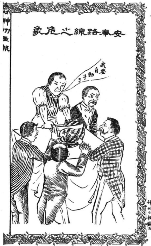
Figure 2. “Anfeng luxian zhi weixiang” 安丰路線之危象 [Image of the danger of the An Feng line], (by Ma Xingchi 馬星馳). [Japanese speaking:] “I want to get my own hands moving.” Shenzhou huabao 神州畫報, 1907.