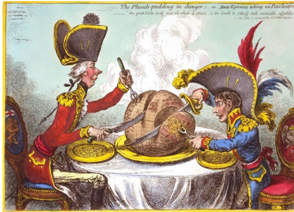
Figure 4. James Gillray, “The Plumb-pudding in danger: -or- state epicures taking un petit souper,” 1805. British Prime Minister William Pitt and Napoleon divide up the world.