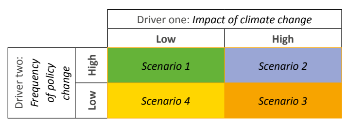
Figure 1. The four scenarios

Scenario 1: This scenario is characterised by a high frequency of policy change and a high level of adaptation to climate change. Governmental policies are driven by the short-term political aspirations of politicians, rather than effective evidence-based decision making.