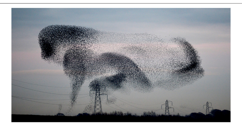
FIGURE 1 | Starling murmuration photographed at the village of Rigg, near Gretna in the Scottish borders, on 25 November 2013. The text discusses similarities and differences between the dynamics of such bird flocks and of the magnetosphere. One coincidental similarity of these two non-equilibrium, multi-body, interacting systems is the potential to cause disruption to power grids. Magnetosphere-ionosphere current systems cause Geomagnetically Induced Currents (GICs) that can give disruption and damage to power supply networks and the weight of the very large number of starlings roosting on the power grid cables in this picture also caused local power disruptions (See The Guardian newspaper (UK), Tuesday 21 January 2014 https://www.theguardian.com/environment/gallery/2014/jan/21/starling-mumuration-season-in-pictures).

however, have the equivalent of highly variable atmospheric conditions, because it is constantly buffeted by the solar wind and subject to variations in solar wind-magnetosphere coupling by the variability of the north-south component of the interplanetary magnetic field (IMF). This means that systems analysis, of the kind used to study a flock of birds and swarming phenomena in general, does have applications in understanding the magnetosphere.