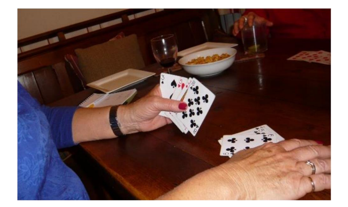
FIGURE 2 A picture taken by Participant 5 when asked to capture views about medication and medication-taking

Although participants did not view donepezil as a cure for dementia, they expected it to have some effect on their dementia; positive or negative. When talking about these effects, however, responses were tentative.