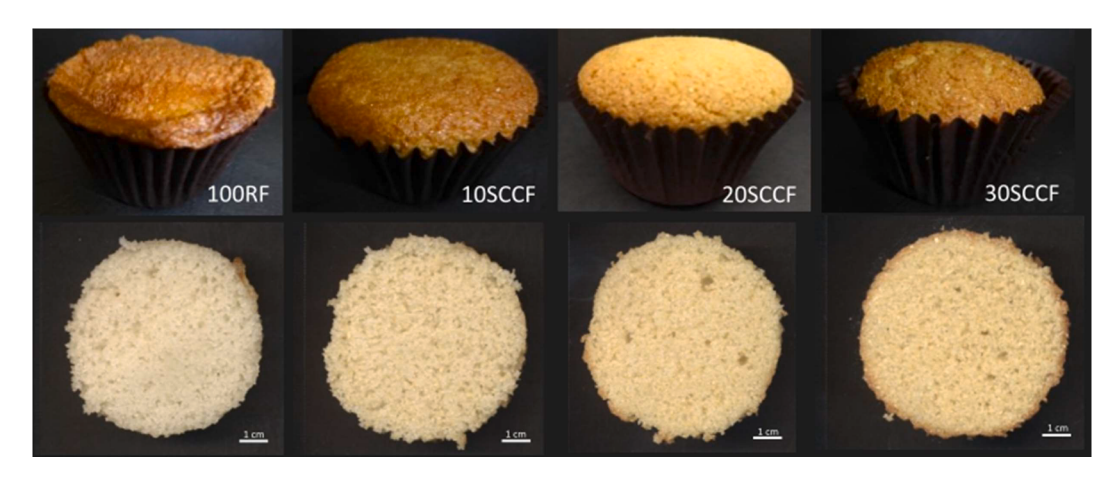
Fig. 2. Pictures of the muffins and scanned images of cross sections of the crumb of rice flour muffin (100RF) and muffins prepared with different level of rice flour replacement by sweet corn cob flour (10, 20 or 30% SCCF).

Lau et al. (2019) showed that SCC flour contains \beta -carotene (177.29 µg/g), lutein (3.81 µg/g) and zeaxanthin (8.47 µg/g). The differences in crust colour between each of the three SCCF samples and the RF samples were perceptible by the human eye ( \Delta E*greater than3).