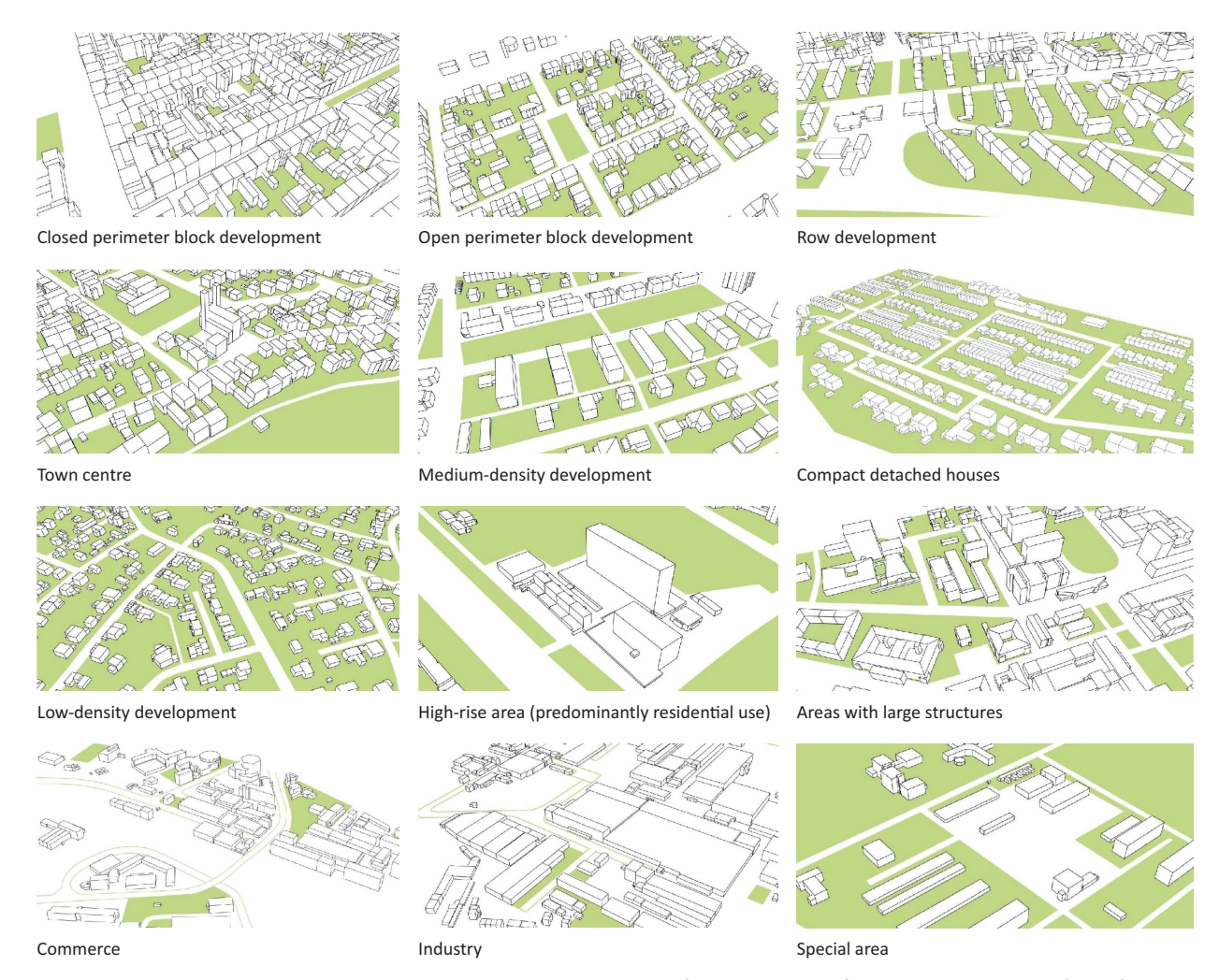
Figure 2. Major urban structure types in Karlsruhe.