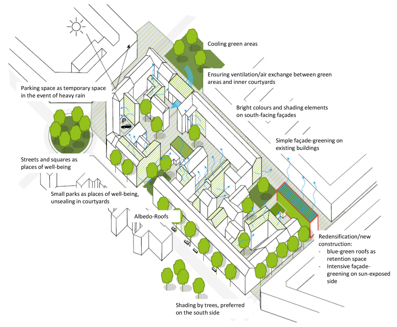
Figure 1. Potential adaptation measure for a compact perimeter block development proposed in the urban development plan.

structure types (Figure 2). A multi-criteria analysis combined the structural characteristics of the neighbourhood with human and societal characteristics, with the latter giving some hints on aspects of human vulnerability (Section 4.2.2). The urban adaptation strategy anticipates that nine of the 12 structure types will require adaptation measures by 2050 because of their relatively high vulnerability metrics (Beermann et al., 2014). The structure types are grouped into three classes (Table 2): medium to high climatic stress, low to no climatic stress, and low exposure to heat stress. These refer to different levels of concern and demonstrate differential adaptation needs to climatic hazards.