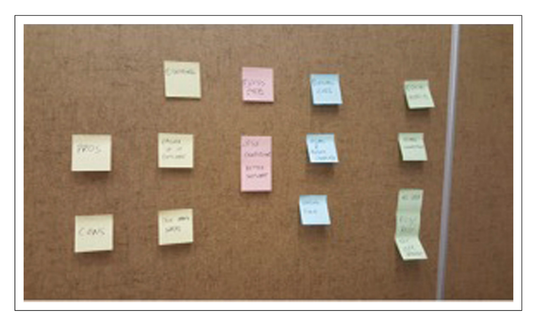
Figure 1. P2's recreation of her work space during Activity 2 with sticky notes representing artifacts at her work-desk

P2 mentioned clutter, changing work-desks, and a smartphone to be her challenge points. Strategies used to mitigate these challenge points were color-coded cheat-sheets and asking for help from other people at work.